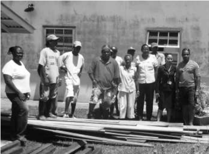
Members of the new Amsterdammers standing in front of the home with some of the materials to be used in its renovation

There is an Executive Committee and Steering Committee as well as representatives who are expected to mobilize others to come on board.