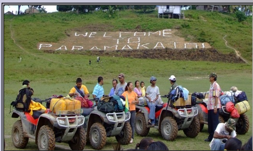
Parents from all villages bringing their children to PK

We hope to spend more time with the dorm kids and we might do some teaching in the evening to help the villagers as well as those taking exams. The air is pleasantly cool and fresh by comparison with Georgetown but still walking to the creek to do my washing takes its toll on my energy. We both need time to adapt to a 6am start, 11pm finish and no electrical washing machines, fridges or microwaves. There is some electricity between 6 and 10 pm; mainly to power lights for studying. This is a large Amerindian village with the Secondary school as a challenging microcosm of Guyanese culture in the middle. If we can adapt ourselves, maybe we will be able to help. But our challenge in the next 3 months will be to try and blend in with our environment. Watch this space for our next installment.