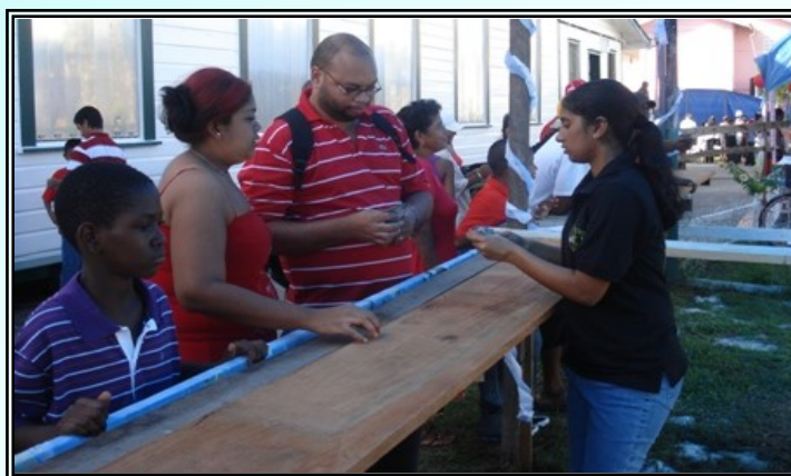
The parish youth at work

The catholic congregation of Victoria conducted their yearly fair. It could be described as simple and community oriented. Bringing people together in a common cause was the attitude the organizers displayed throughout planning and executing the annual event.