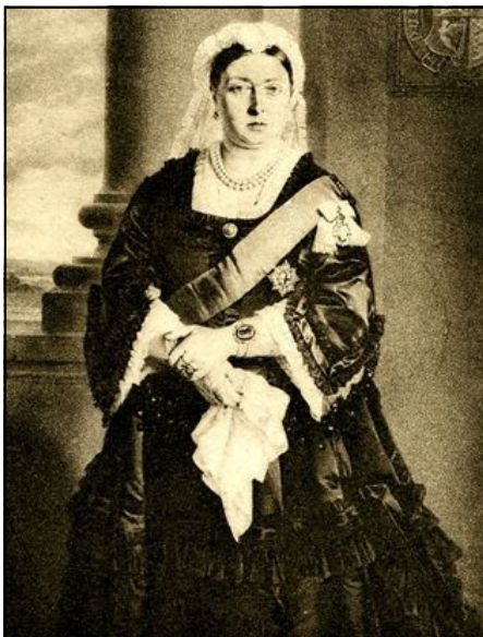
A portrait donated by Queen Victoria to commemorate her visit to Beaumont College in March 1882