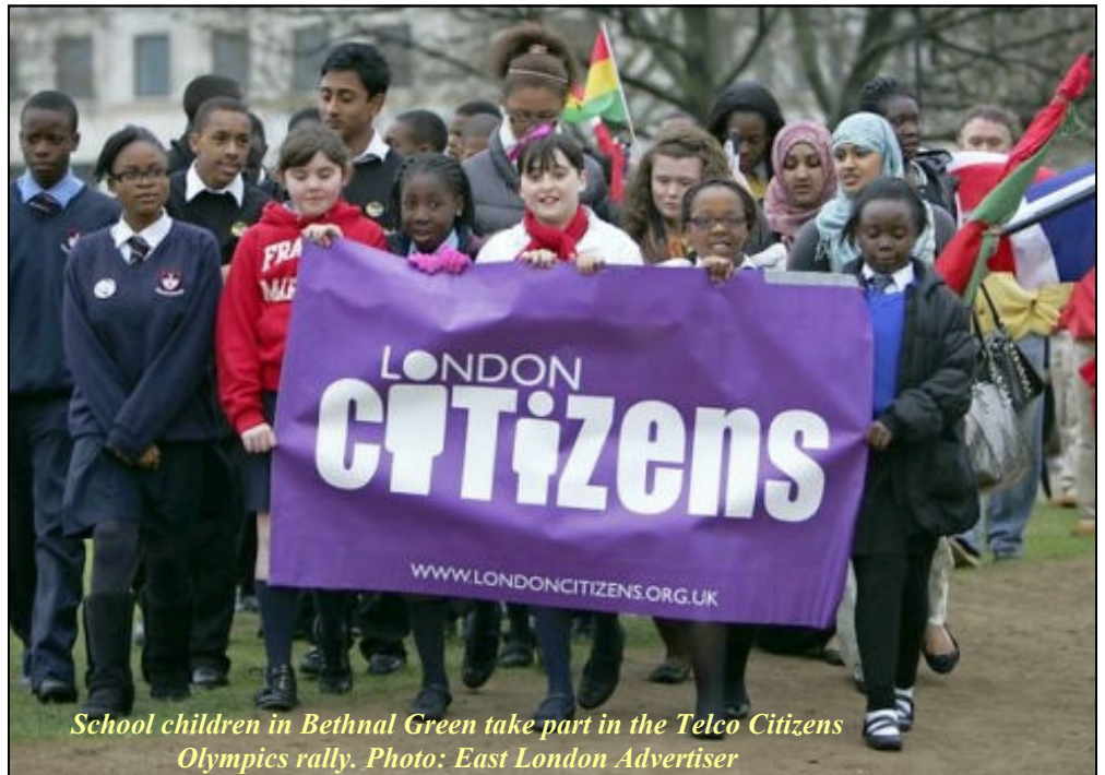
School children in Bethnal Green take part in the Telco Citizens Olympics rally.