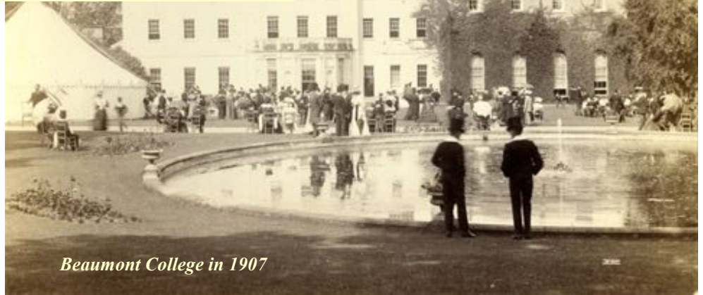
Beaumont College in 1907

Manresa House in Roehampton continued to flourish until the noviceship moved to Harlaxton in Lincolnshire in 1950. In addition to the work that the novices did, especially catechetics in most of the local parishes, it added a printing press, a farm and a private cemetery. Apart from being bombed during the Second World War, with one Scholastic killed, it was a great start for many in the Society.