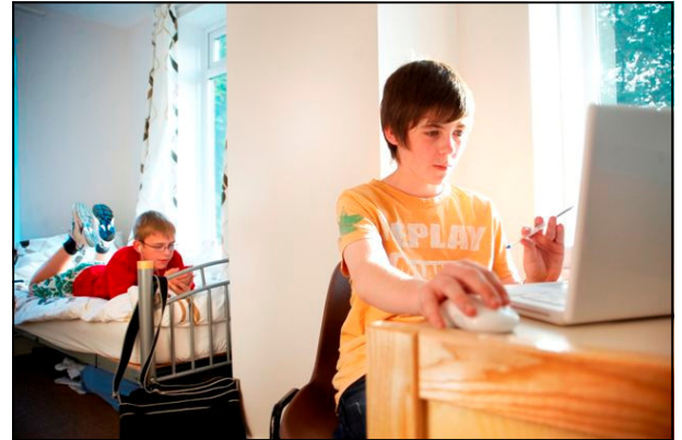
Boarding at the Mount offers company as well as privacy

"In the last few years, the popularity of boarding has increased significantly and sixth form boarding is particularly attractive to pupils as a